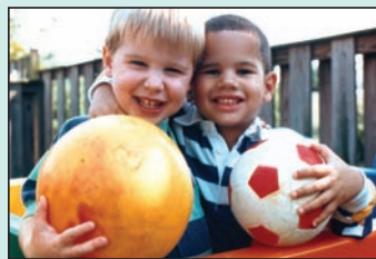
Here's what someone with normal vision would see.

When the researchers later looked at differences in the diets of people as they entered the study, "we found that people who ate fish at least twice a week had almost a 50 percent reduction in the risk of