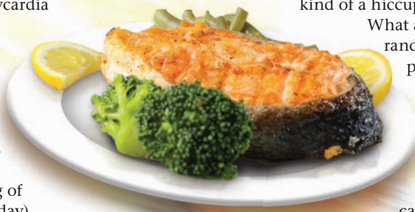
Experts recommend two servings a week of fatty fish like salmon.

recently suffered a heart attack to take either fish oil (850 mg of DHA plus EPA a day) or to see their doctor as usual. After 3½ years, the fish oil takers were half as likely to have died of a sudden death heart attack. 4