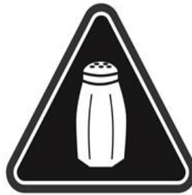
New York City's sodium warning icon.