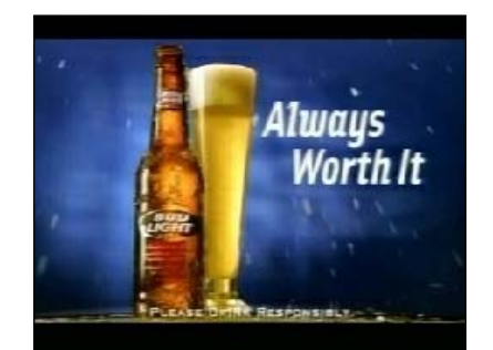
(SFX OUT) (SFX: BEER BEING POURED IN GLASS IN) MALE ANNCR: Refreshing smooth Bud Light. (SFX OUT) MALE (VO): Ahh! ANNCR: Always worth it.