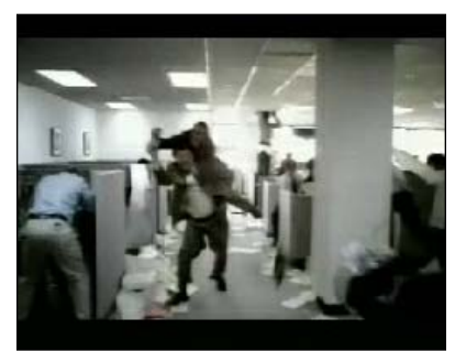
(SFX: PEOPLE DESTROYING OFFICE WHILE SEARCHING FOR BUD LIGHT