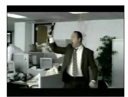
(SFX: MAN SCREAMS IN & OUT)