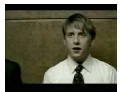
I had an idea to hide Bud Lights all