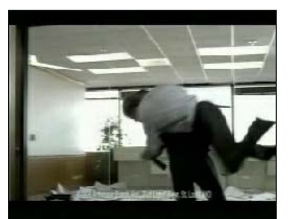
MAN: I guess the savages didn't find all of them. (SFX: MAN GETS TACKLED IN & OUT)