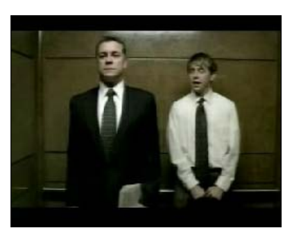
DAVIS: Actually sir I spent most of mine