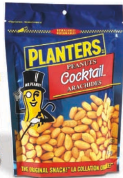
Thanks to the smaller serving size, the nuts in the foil bag look better for you than the (identical) nuts in the canister.

■ Shells. When you can, buy nuts in the shell. It may slow down your snacking.