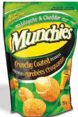
You don't need the salt in the “coating.”

At least Blue Diamond Almonds “100 calories per bag” doesn't pretend to be anything other than a mini-snack. Stick to a single (18-gram) bag and you'll keep a lid on calories.