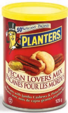
The best mixes are at least 50% pecans, peanuts, or another Best Bite nut.

Tip: Look for brands that say “50% less sodium” or “lightly salted” on the label. But always check the sodium (and the serving size) on the Nutrition Facts panel.